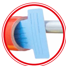
Media cards REF: PHTIEIR