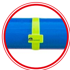
Roll clips REF: PHTIASR