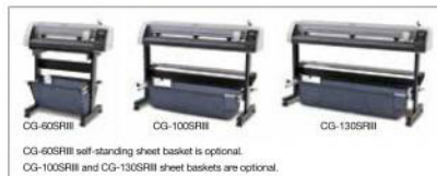
CG-60SRIII self-standing sheet basket is optional. CG-100SRIII and CG-130SRIII sheet baskets are optional.

CUTTING PLOTTER CG-SR III Series CG-60/100/130SR III